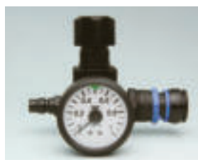
Pressure gauge kit including pressure reducing valve and two couplers.

Note: When using BIM**04S types, this item is necessary.