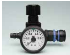
Pressure gauge kit including pressure reducing valve and two couplers.

Note: When using BIM**04S types, this item is necessary.